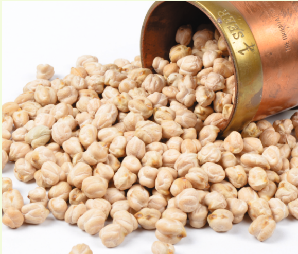
Grains & Pulses