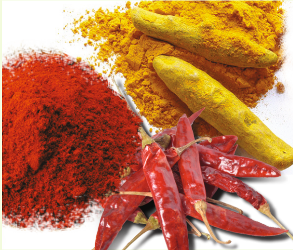
Whole & Ground Spices