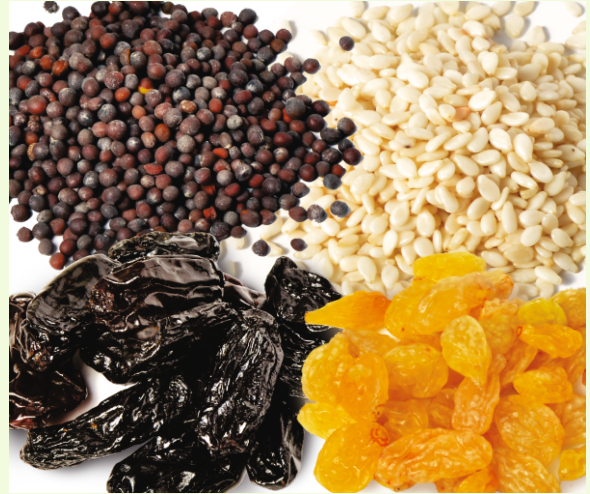
Oil Seeds, Dry Fruits & Nuts