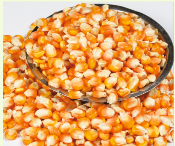
Animal & Poultry Feed